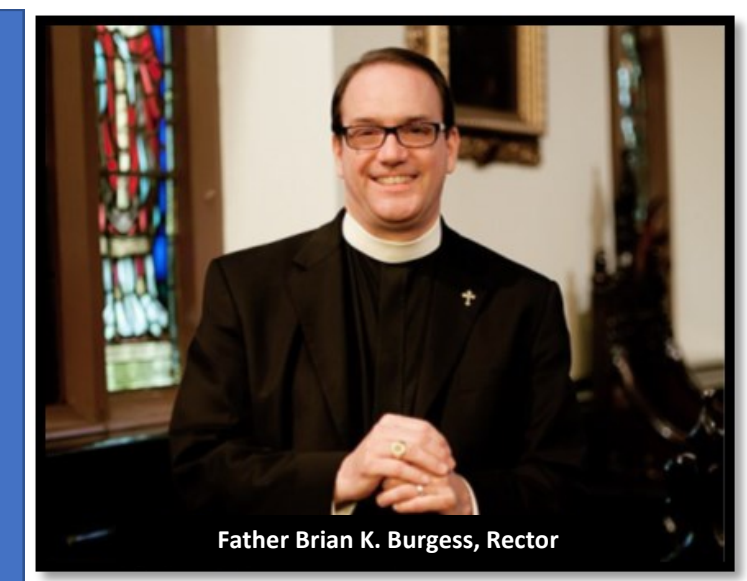
An invitation from the Rector I invite you and your families to join all those of Christ Church Woodbury who begin each conversation, each offering, and each reach as a people of Great Thanksgiving.