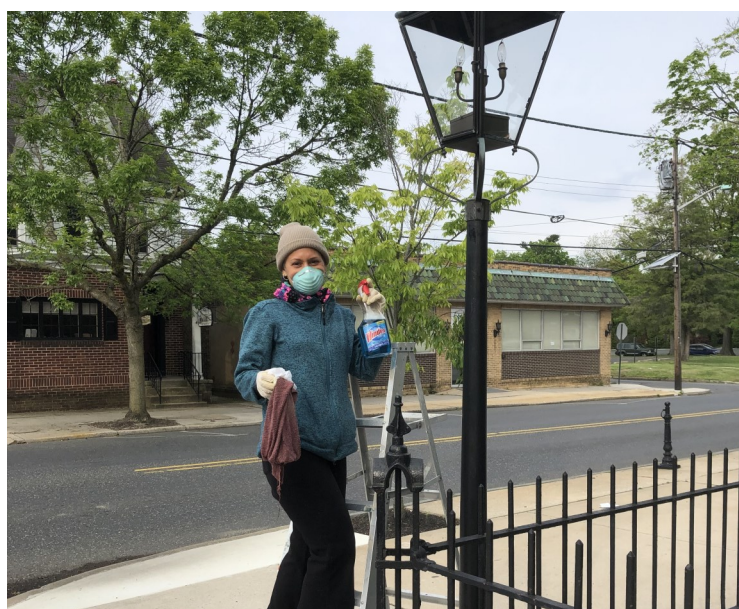
Continuous cleaning, inside and out