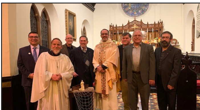
Men of Christ Church's Brotherhood of St. Andrew gathered after the Eve of the Feast of St. Andrew Mass