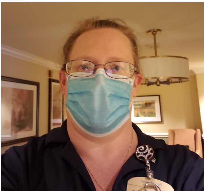
New safety procedures for health care workers