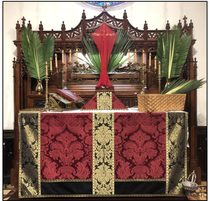
Palm Sunday: The Beginning of Holy Week