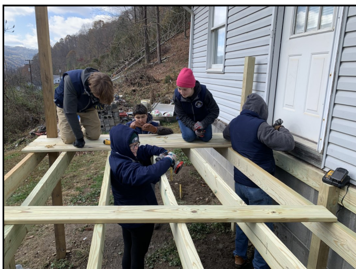
Mission team at work in the coal-mining community of Dante, Virginia