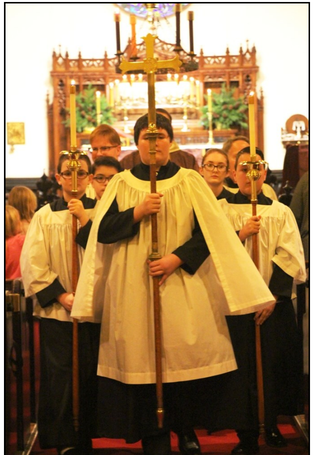
Acolytes process during the Feast of St. Nicholas

The Society of St. Alban: Recognizes Millennials (ages 22-39) of this parish who make a pledge, return an electronic giving card, or make an annual gift of $100.00 or more.