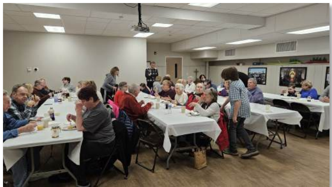
Shrove Tuesday Pancake Supper